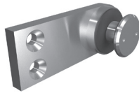
Single Flat Arm